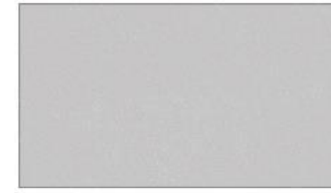
RAL 9007 M. Satin Silver