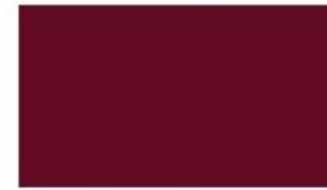
RAL 3005 Wine Red