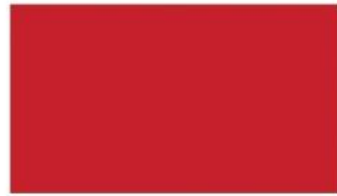
RAL 3000 M. Flame Red