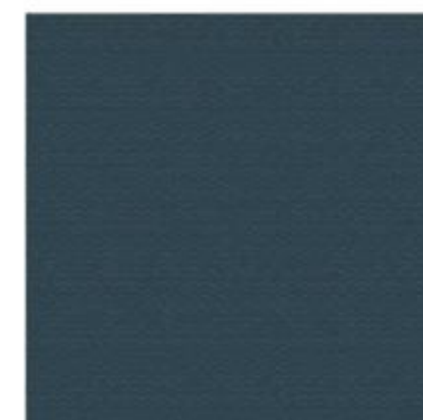
RAL 7015 M. Tex Aero Grey Texture