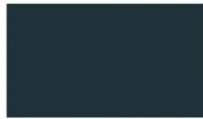
RAL 7026 Granite Grey