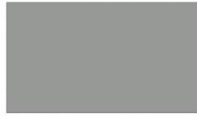
RAL 7030 Stone Grey