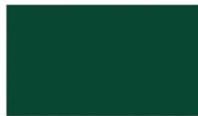
RAL 6028 Pine Green