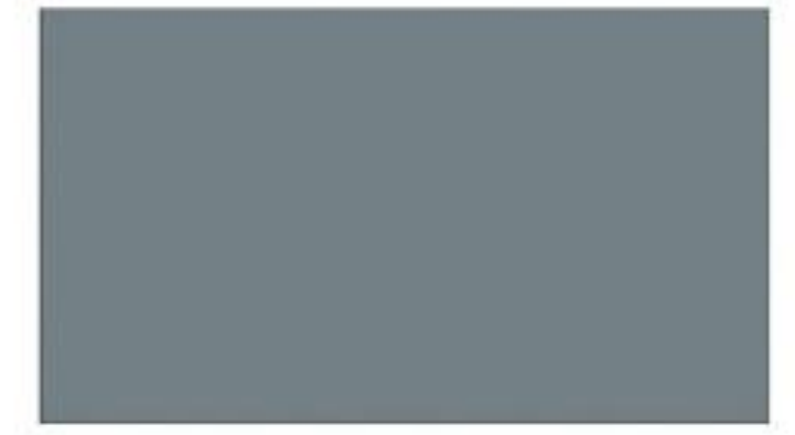
RAL 7045 Tele Grey 1