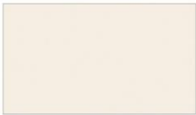
RAL 1013 Oyster White