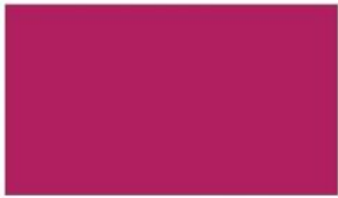
RAL 4010 M. Pink