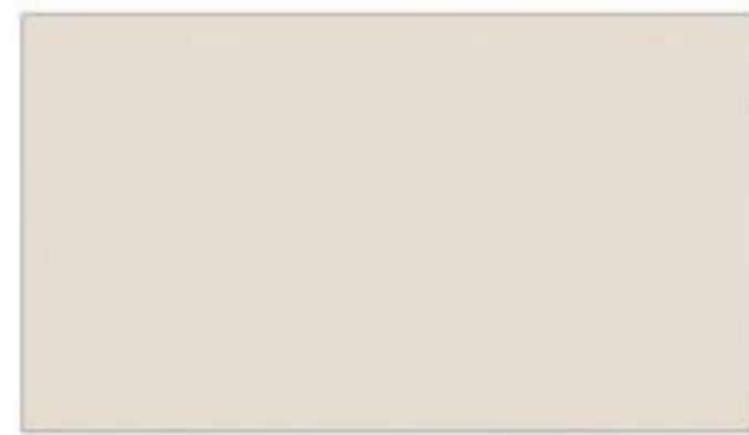
RAL 1015 Light Ivory