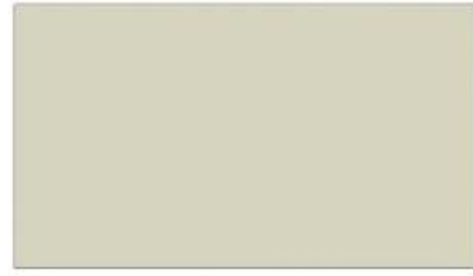
RAL 7032 M. Light Putty