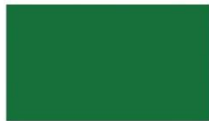
RAL 6001 Emerald Green