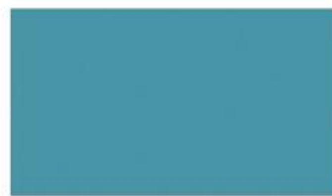
RAL 5024 M. Pastel Blue