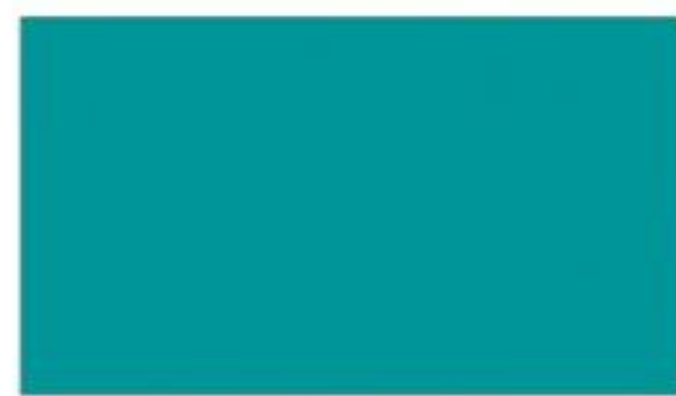
RAL 5018 Turquoise Blue