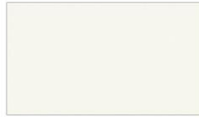
RAL 9002 Grey White