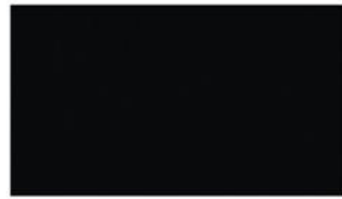
RAL 9004 M. Ikea Black