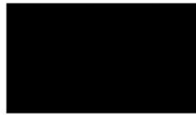
RAL 9011 M. Satin Black