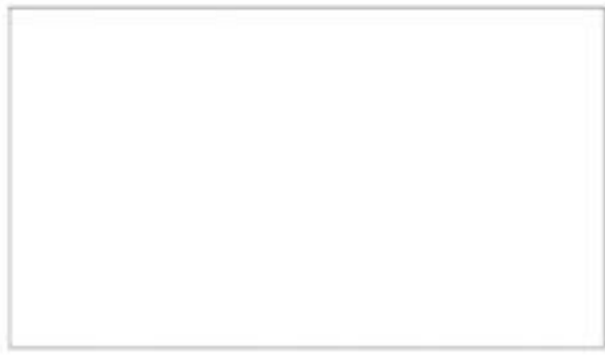
RAL 9010 Pure White