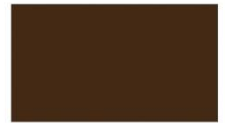
RAL 8028 Terra Brown