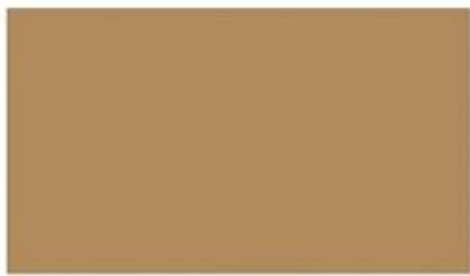
RAL 1011 Brown Beige