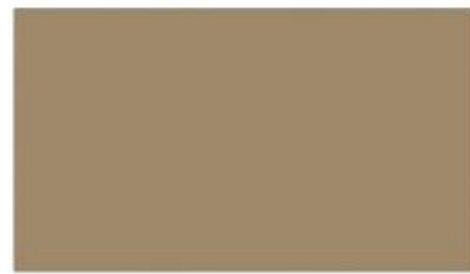
RAL 1019 Grey Beige