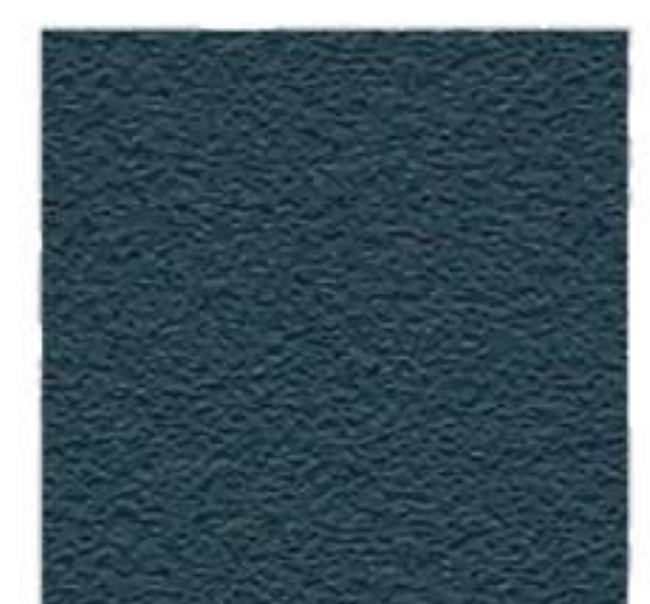
RAL 7024 M. Dark Grey Structure / Ripple