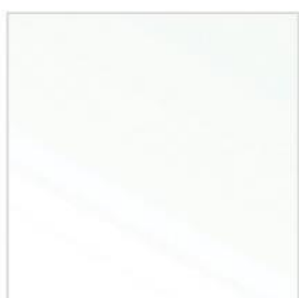
RAL 9003 M. Pearl White Glossy