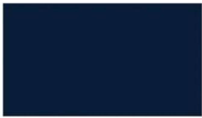
RAL 5003 M. Dark Blue