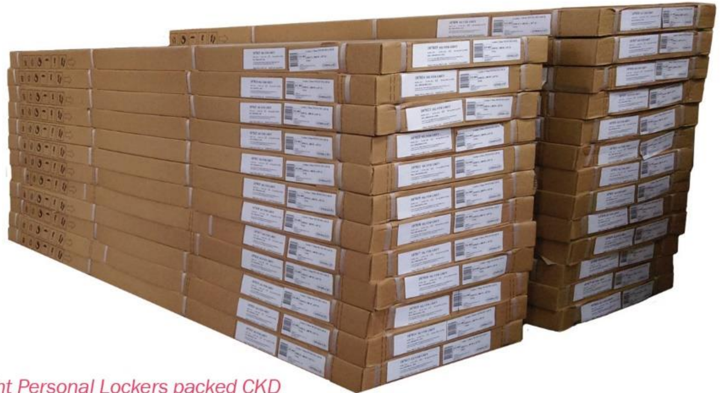
Stack of Full Height Personal Lockers packed CKD

The flat pack product provides a winning combination to our Channel Partners and final customers. The flat pack reach our Partners safely at a lower cost wherever they are located across the globe. It takes up very little storage space besides ensuring quick assembly.