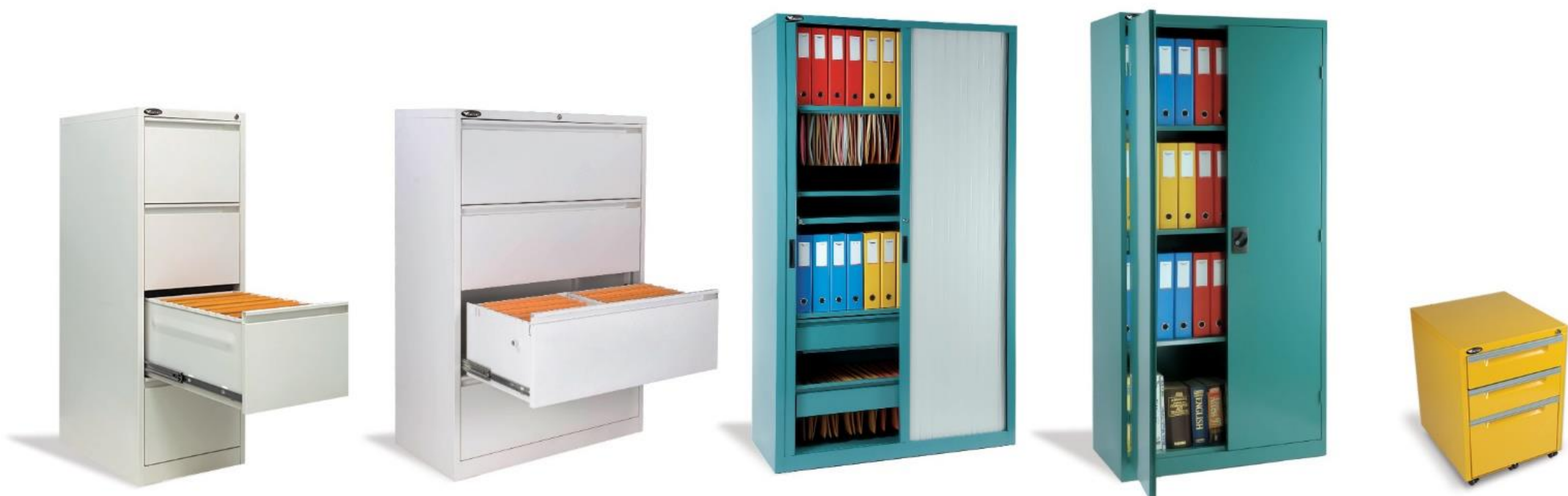
Vertical Filing Cabinet