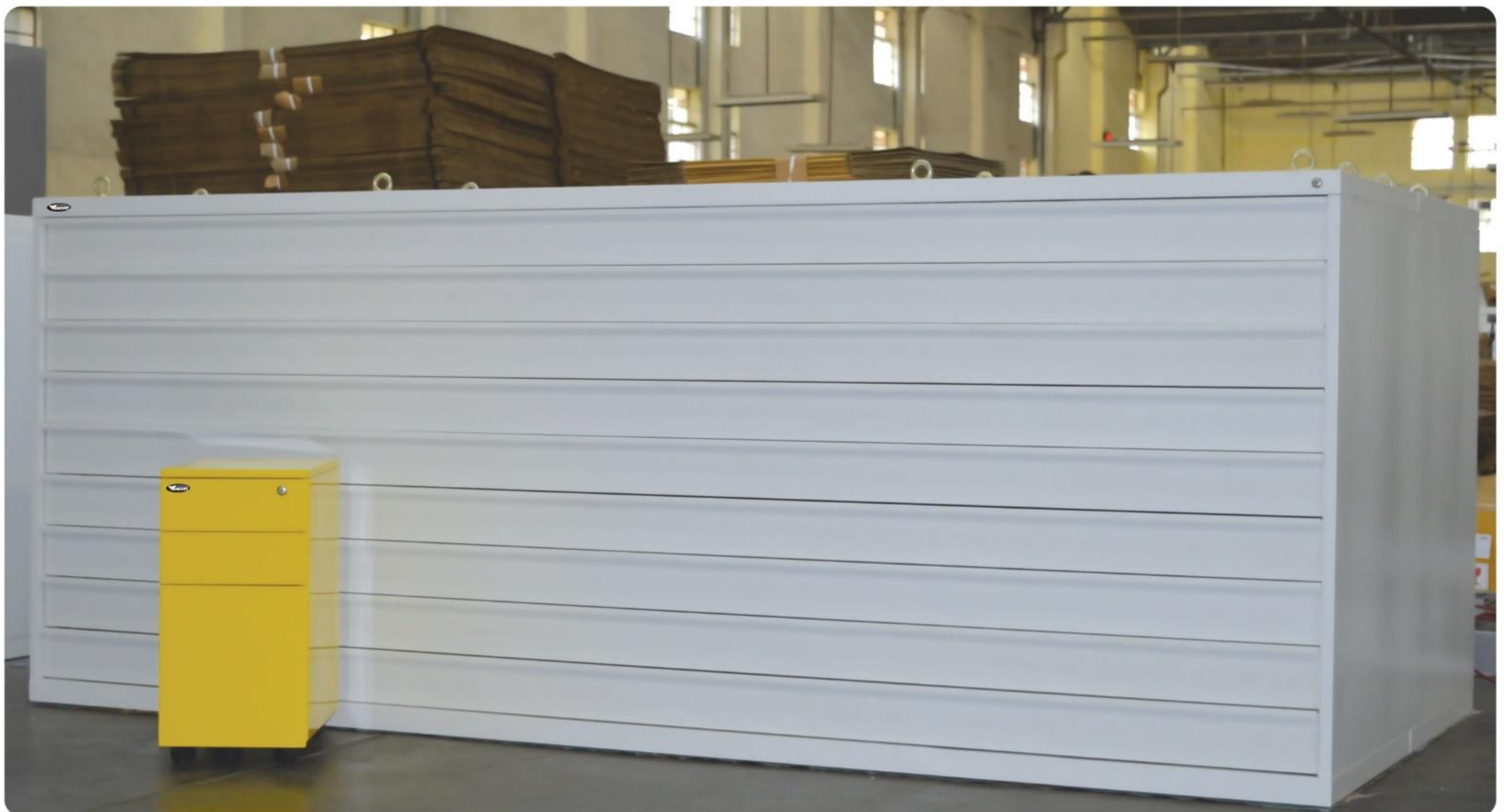
Pedestal: H 635mm XW 300mm XD 515mm; Costume Storage Cabine: H 1200mm XW 3115mm XD 1500mm

The flat pack product provides a winning combination to our Channel Partners and final customers. The flat pack reach our Partners safely at a lower cost wherever they are located across the globe. It takes up very little storage space besides ensuring quick assembly.